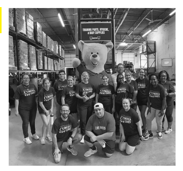
Volunteers from Comerica helped put together packages for new babies and moms. We rely on community helpers! In 2023 volunteers served 3,340 hours .

96.5% of total revenue goes directly to our critical needs program.